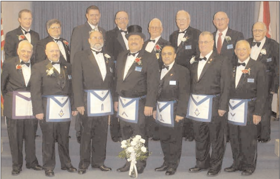
The Officers of John W. Barkley Lodge

Please Remember Your Lodge in Your Will. Thank You, Very Much!